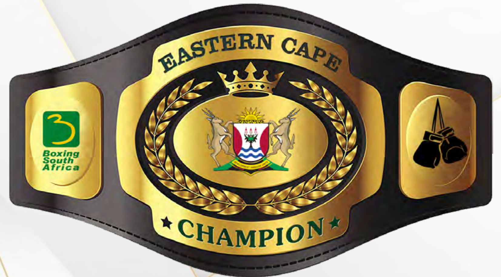
Newly launched Eastern Cape Boxing Championship Belt